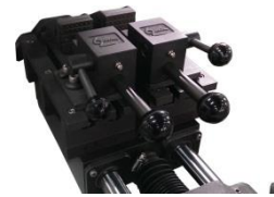
Option- Separated vise with feeding table

With the right/left vise a movement 25mm in X-axis