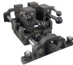
Standard vise – horizontal movement vise

With the right/left vise a movement 25mm in X-axis